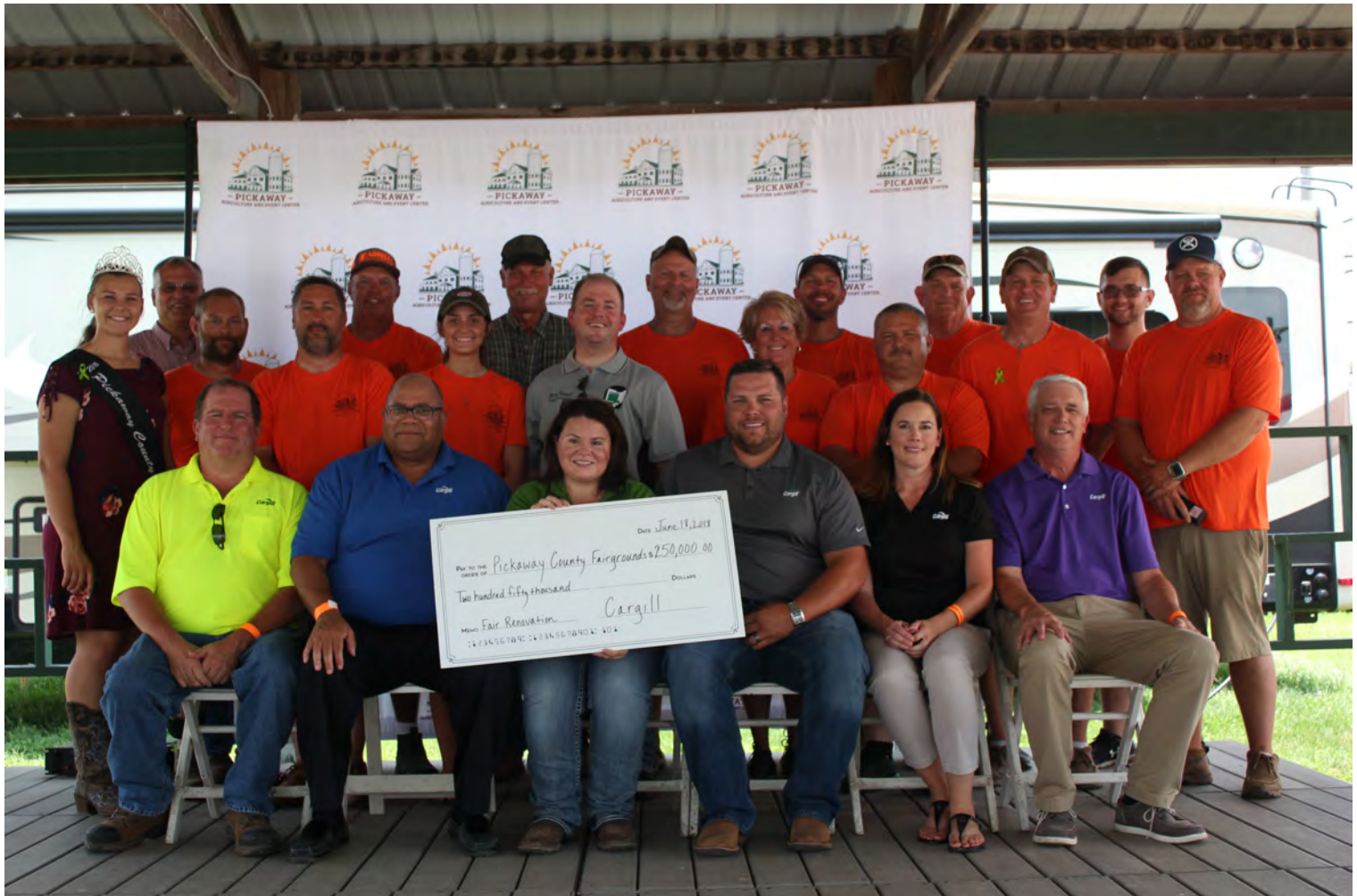
Cargill's check presentation at this year's fair of $250,000 to the Project